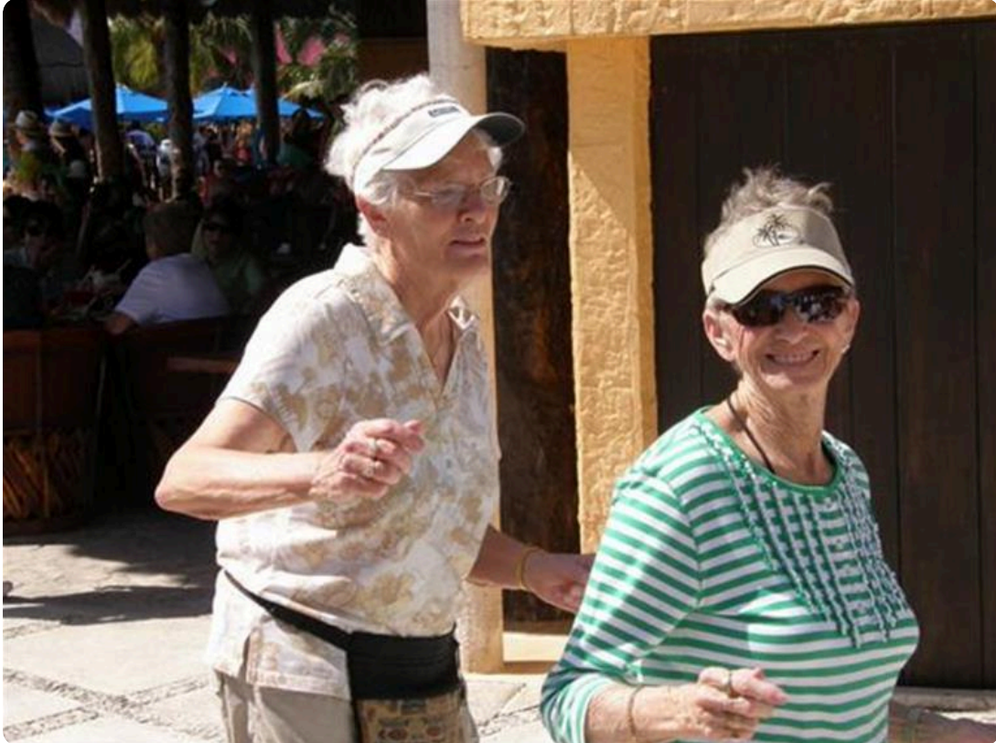
Line dancing in the street in Mexico