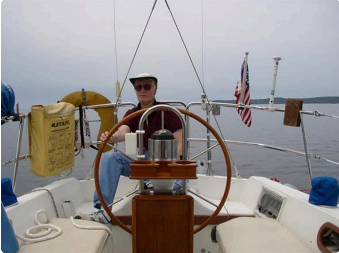
Captain of her ship